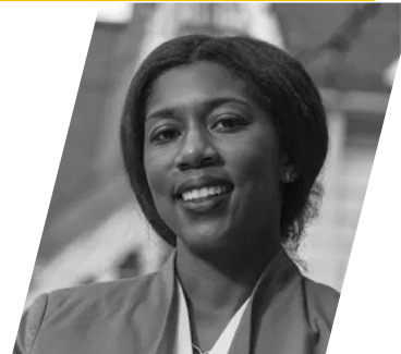
MARITA GARRETT Mayor of Wilkinsburg, PA