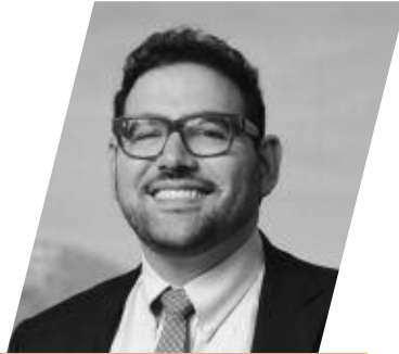
PETER SVARZBEIN Councilmember, City of El Paso, TX